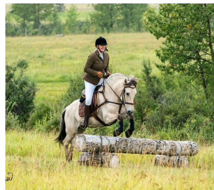
2009 Colt Out of Jasper's Troika (NFH Jasper x Share a Lot)