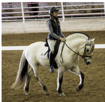
Bastian

Bastian has competed in USDF recognized and schooling shows, garnering high scores, championship ribbons, and a fan club. He's participated in Equine Liberty clinics, mounted archery, and helped a troop of Girl Scouts earn their horsemanship badges.