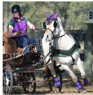
Ironwood Xander 2012 Colt out of FC Madellin (Modellen x Lin)