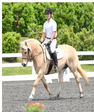
Ironwood MaryAnn 2009 Filly out of Lynnhaven Elli (BDF Malcom Locke x Grete)