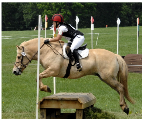
Ironwood Roheryn 2009 Colt out of Lupin (Karibu x Serina)